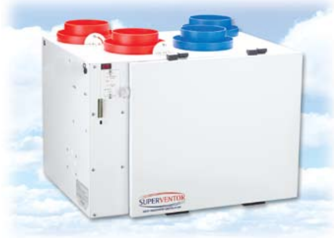
MODEL SHOWN: SHRV 124T